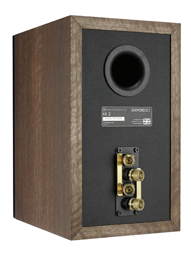
The rear port has been optimised to work in unison with the drive units to assist low-end response. Two sets of terminals allow for optional bi-wiring with metal links provided for single wire connection.

successfully as the Diamond 12.1 is remarkably free from audible boxy colourations; performing the knuckle-wrap test confirmed the resonance-free rigidity of the cabinet.