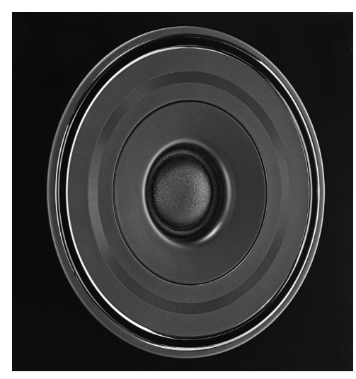
The Diamond 12.1's HF dome is made from a woven polyester film with a high gloss coating. The front plate is contoured to aid dispersion.