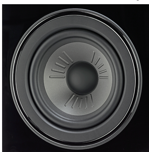
Wharfedale's proprietary Klarity cone material is lightweight yet rigid and further stiffened with raised ribs. The low-damping surround is designed to minimise colouration and improve dynamic expression.

Talking of reinforcement, the cabinet employs what Wharfedale describes as 'Intelligent Spot Bracing' to reduce cabinet resonance. This is done